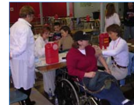
Health districts provide medication and vaccinations in an emergency.

If we all help to perform the necessary tasks, our health district will be prepared to respond to any emergency and protect our community's health!